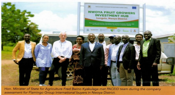
Hon. Minister of State for Agriculture Fred Bwino Kyakulaga met PACEID team during the company assessment for Flamingo Group international buyers in Nwoya District.

In 2023, PACEID realised the achievements below with the support of Uganda's Trade Representative in the UK: