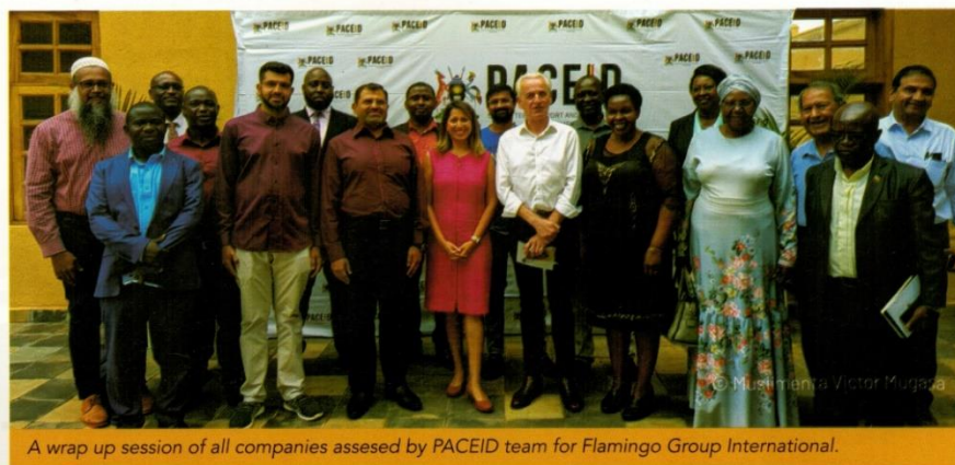
A wrap up session of all companies assessed by PACEID team for Flamingo Group International.

Fruit and Vegetable Journalism Tour: These tours will promote Uganda's F&V sector to the buyers and investors in this sector.