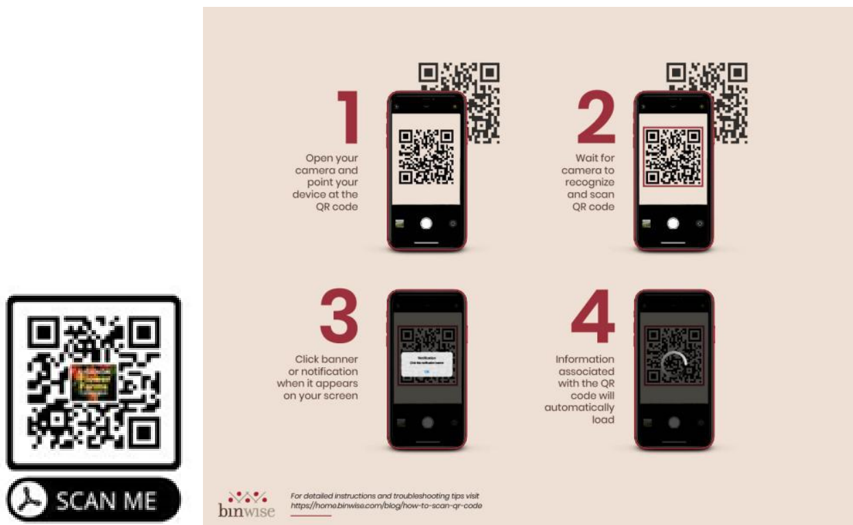
Figure 1: Steps on how to scan QR Code

Using QR Scanner, smart scanner option or normal camera on your phone.